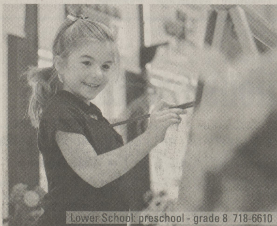
Lower School: preschool - grade 8 718-6610