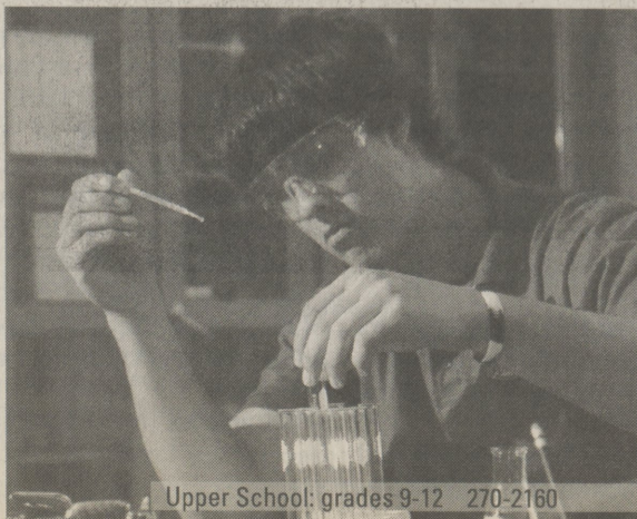
Upper School: grades 9-12 270-2160