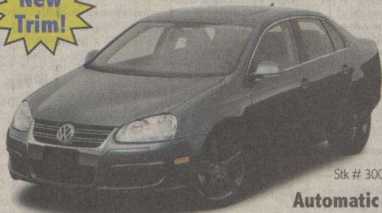
Stk # 30080