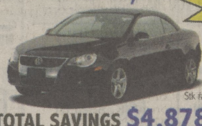
Stk # 39194