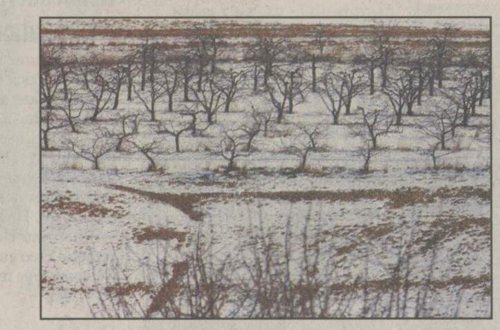
Snow melts from the fields at Brace's Orchard, Orange.

Finally, amendments are proposed for the fee schedule, which requires the payment of various fees