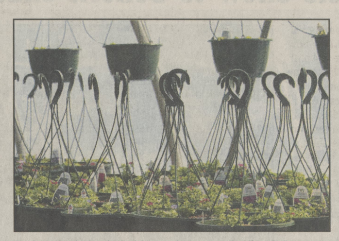
Spring plants begin to bloom at Norman Darling & Sons Farms and Gree nhouses, Dallas.