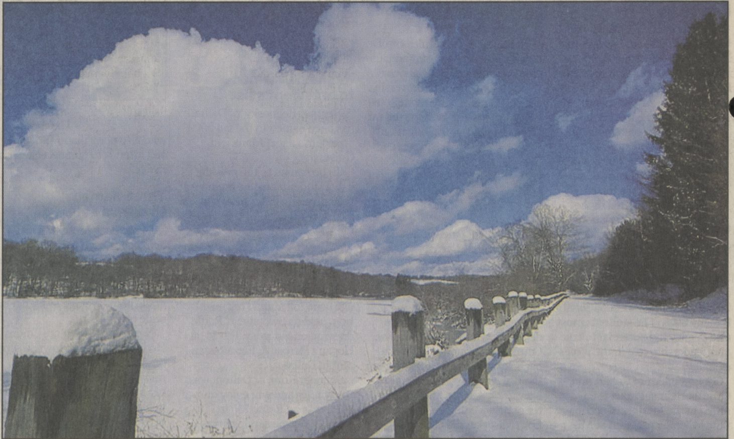
Deno Pantelakos, of Idlewood Drive in Dallas, shot this scene at Frances Slocum State Park last November when there was snow on the ground.

"YOUR SPACE" is reserved specifically for Dallas Post readers who have something they'd like to share with fellow readers.