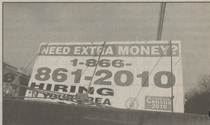
A pick-up truck with a portable sign is part of a movable job fair for the 2010 Census Department. A fair was held last Saturday at Back Mountain Bowl in Dallas.