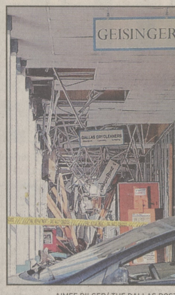
Dallas Shopping Center businesses suffered heavy damage.

"It's just a shame," he said. "I saw it on TV and stuff but to see it up close, it was pretty devastating."