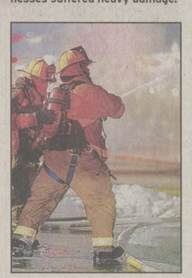
Firefighters battle a Monday night blaze at the Dallas Shopping Center.