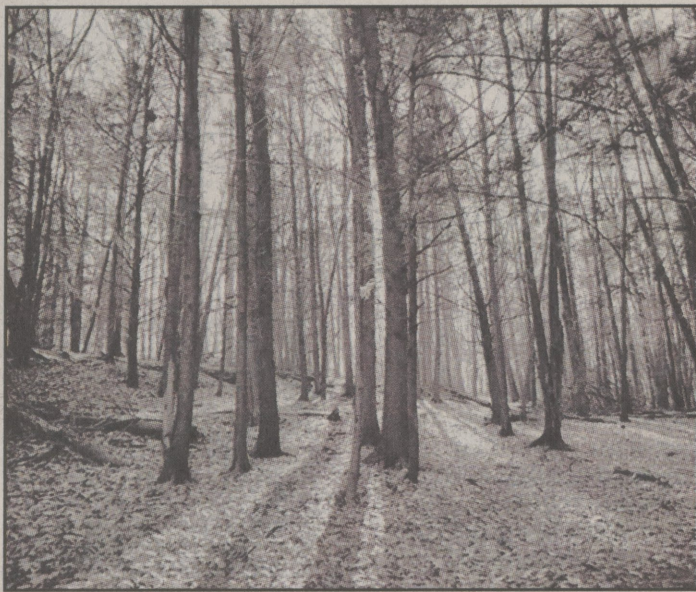
This scene from the Frances Slocum Trail in Frances Slocum State Park has been dubbed "Shadow & Light" by photographer Deno Pantelakos, of Idlewood Drive in Dallas.