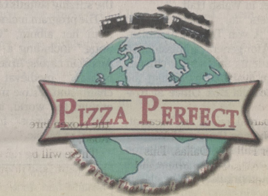
Pizza Perfect is famous for their Sicilian Style Pizza available with all the toppings one could want. They also offer specialty pizza for those hungry for a different taste. Such as, White Fresh Tomato Three Cheese with seasonings and Broccoli with Double Cheese & Onion and now Chicken Wing Pizza is available.

Order your Wings Mild, Hot, Fireman's Friends or Bar-B-Que or choose a full of half rack of mouth watering Ribs. Looking for a Hot Sandwich, Dog or Burger?; they have a full selection to satisfy. And Don't forget to try one of their 3 BBQ's!