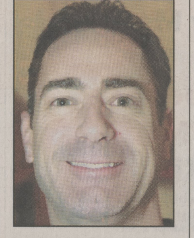
"Maybe I'm being selfish but I remember more open land and fields to play in growing up and I'd like it to be more like that."