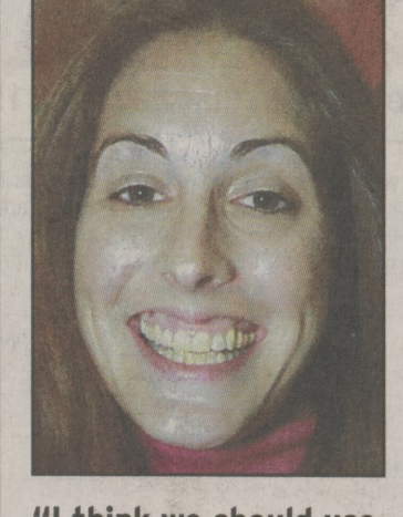
"I think we should use the lots that are already available before we clear away any more nature."