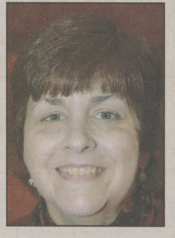
"The current infrastructure - parks, sewers and schools needs to be developed first.