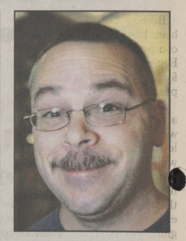
"It should be limited. The water tables get too low and there are too many traffic issues."