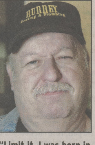
"Limit it. I was born in the country and people who move in have different lifestyles and are always telling the farmer how to live."