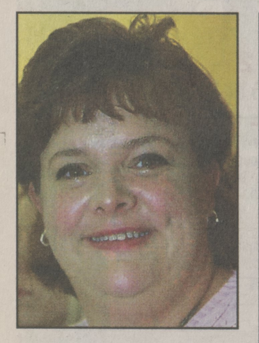
"Development should be limited because we don't have the infrastructure - enough roads, water systems and shopping."