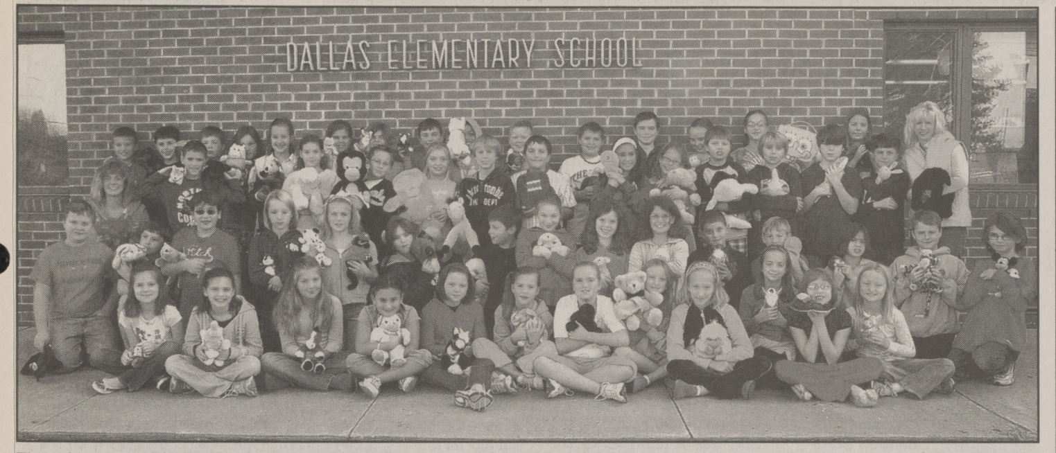
These fourth and fifth-grade students at Dallas Elementary School, along with their parents and counselors, celebrated Drug Free Week recently.