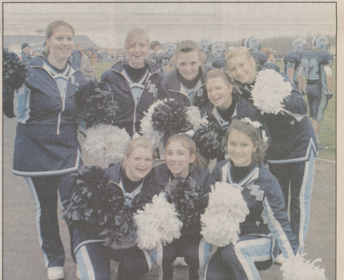
The Dallas cheerleaders take a moment to pose for a photo.