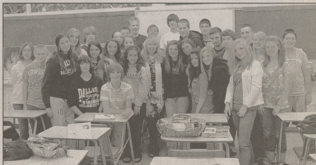
Members of the freshman class of Dallas High School will sell tickets during Thanksgiving weekend to benefit Community Care for Kids (CCK). Selling tickets, at $10 each or $25 for three, to benefit CCK is one of two community service projects the class will conduct this year.