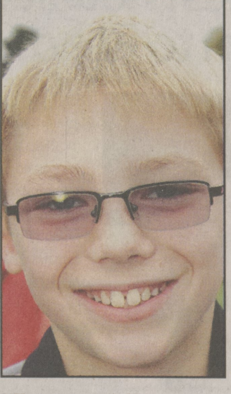
"To support the troops in Iraq or any veteran who fought in a war."