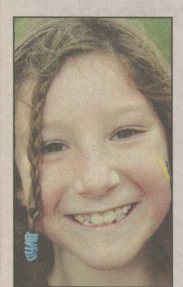
"I'm not sure; it's too hard a question to answer."