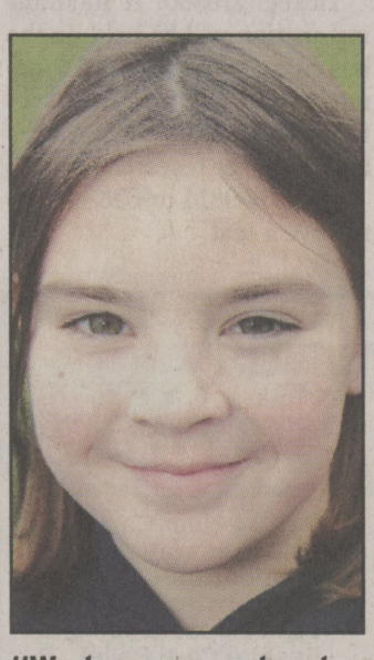
"We honor people who died in any war."