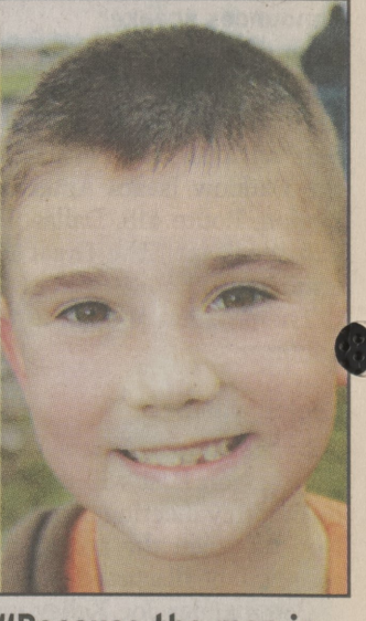
"Because the men in the Army save peoples' lives."