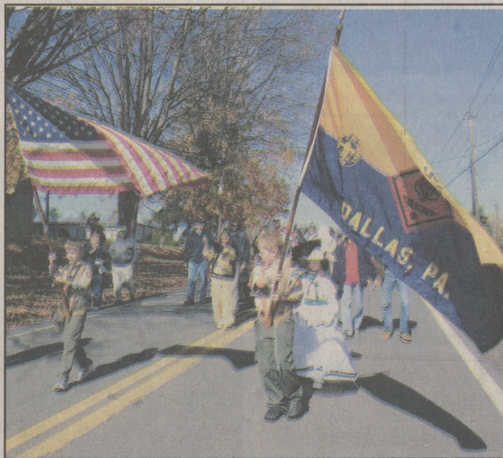
With a shortened route this year, the Dallas Kiwanis Halloween Parade was led down Church Street one block to the Dallas Firehouse where refreshments were provided by the Back Mountain Business Association and other community sponsors.