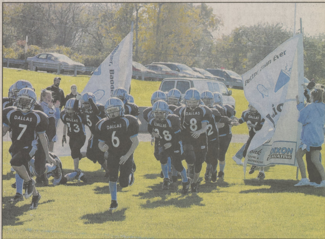
Members of the Dallas Jr. Mounts B team enter the field prior to their playoff game against the Plymouth Shawnee Indians.