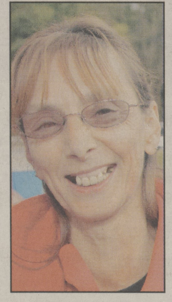
"I don't know, but my grandson wants me to."