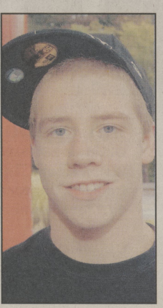
"No, not that I know of."