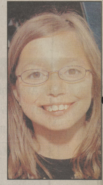
"Yes, I plan on going to the 'Haunted Library."