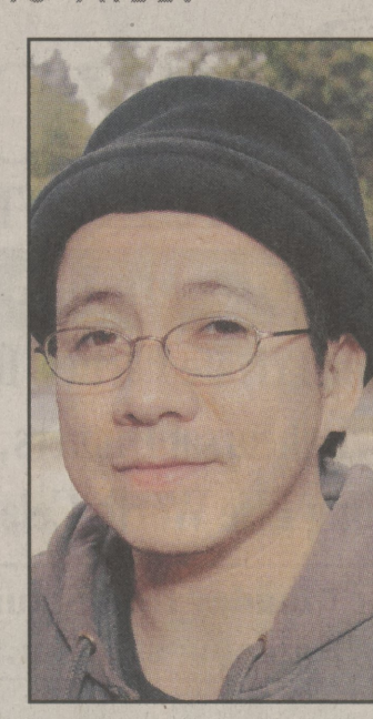
"I don't partake in things like that."