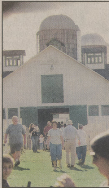
Festival-goers tour the barns at Hillside Farms with many exhibits on display.