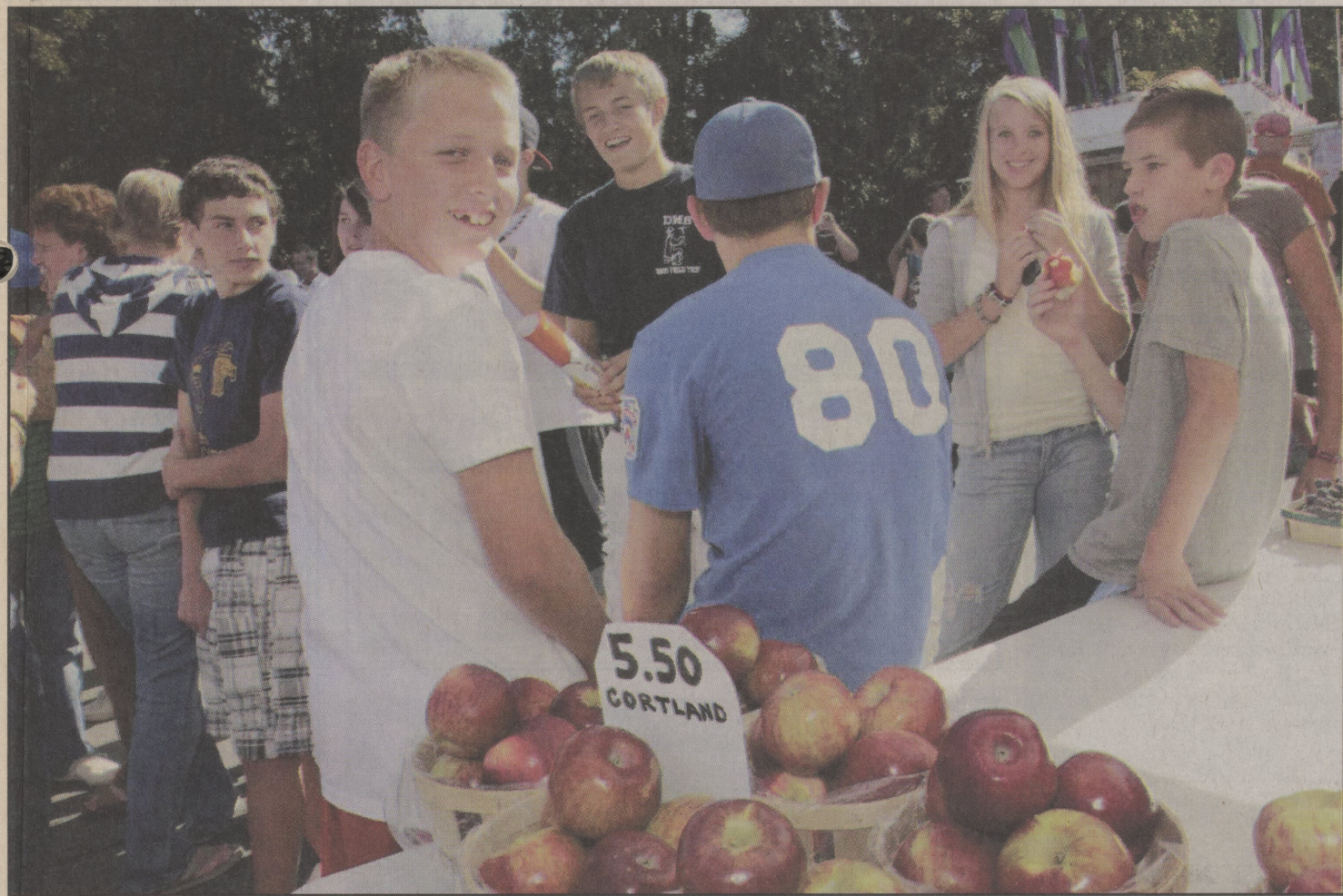
Attendees of the annual Dallas Harvest Festival always find many local fruits and vegetables to enjoy.