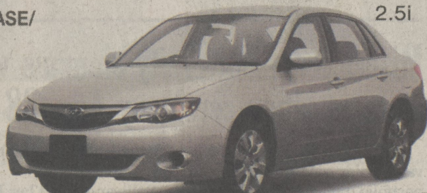
(Model 9JB) Automatic

$2,288 Total Due at Delivery* *Plus tax and tags.