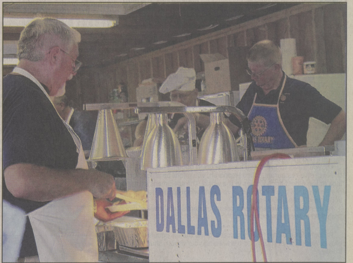
Members of the Dallas Rotary man the food booth.