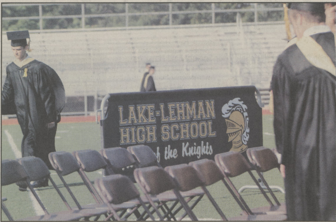
Soon-to-be graduates begin to fill seats at Edward Edwards Stadium prior to Lake-Lehman commencement ceremonies.

Class song: "Only the Good Die Young" by Billy Joel