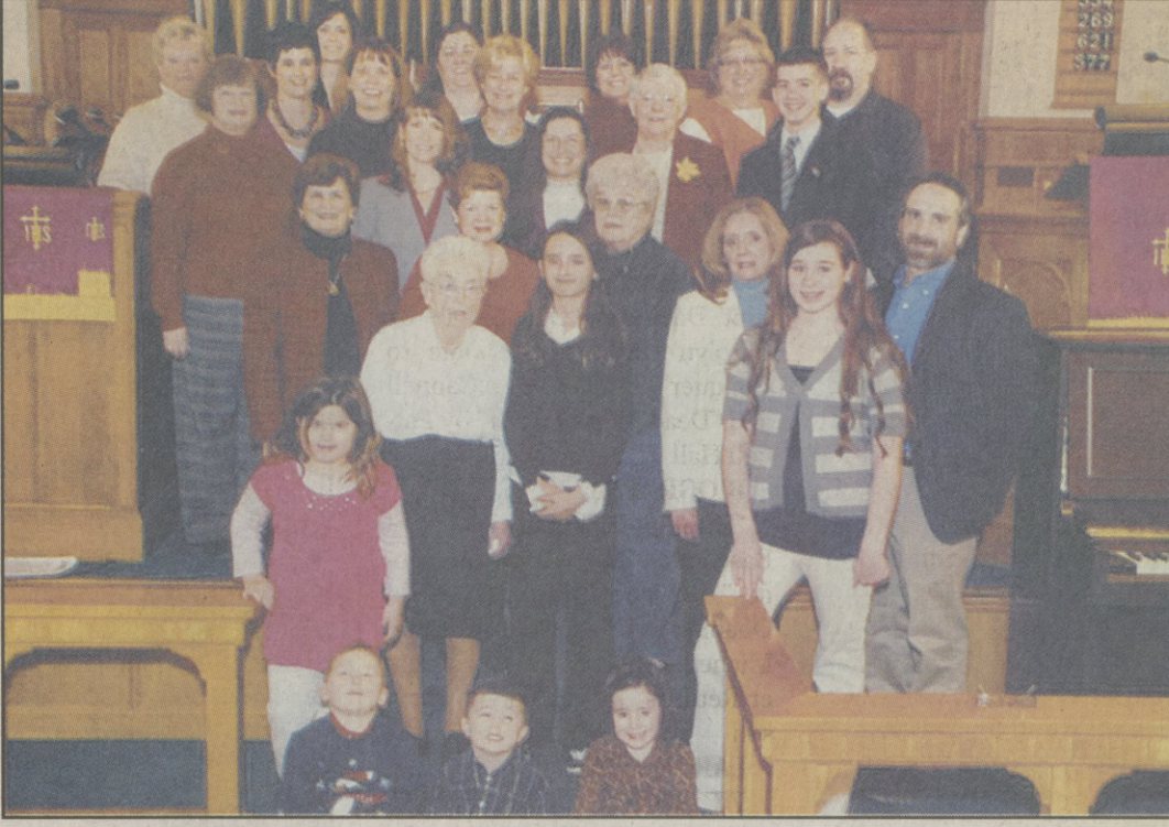
Members of several choirs from the Dallas United Methodist Church will hold a musical concert, 'Songs of the Season,' at 4 p.m. on Sunday, May 17, in the church sanctuary.