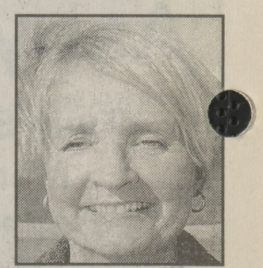
"Spend it on a vacation to Hilton Head."