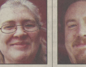
"Gather with the family and have an Easter egg hunt at