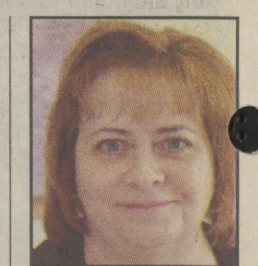
"We'll have a big dinner, ham, and our whole family gets together."