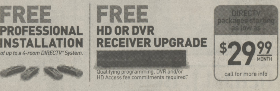
ORDER TODAY and you'll also receive:

Alles Antonio B Stoney -CSDAN FSN 200 CAR Y i 需 (IMN no Lifetim ohi OVC 100000 One TNT sprout BPIKE and more! 16 u.a Me Plus access to over 30 premium HBO OWTHE starz d in select O CU CBSO FOX movie channels! Included markets