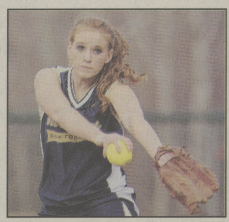
mound for Northwest.