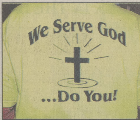
Members of the Trucksville United Methodist Church wore their "We Serve God" t-shirts during the lasagna dinner they served.