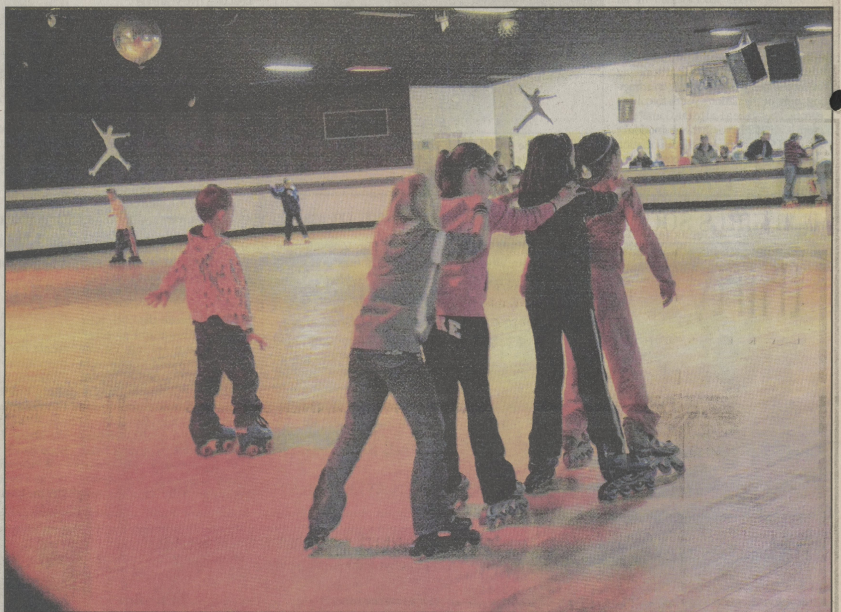
Students from Wycallis Elementary School recently enjoyed a PTO-sponsored roller-skating party.