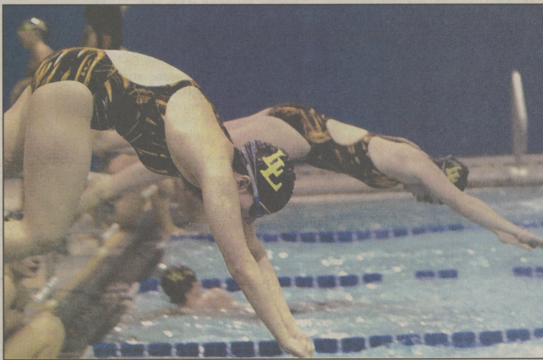
Lake-Lehman swimmers dive into the pool.