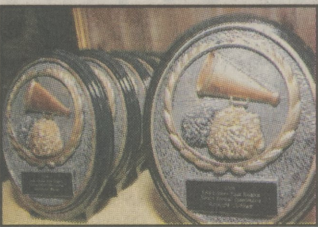
There were plenty of awards to go around at the Lake-Lehman Football Banquet.