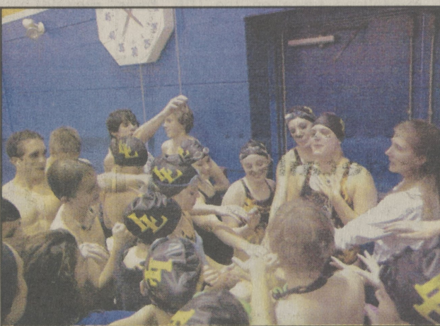
The entire Lake-Lehman swim team gets together for a cheer before the meet.

To see more photos, go to www.mydallaspost.com