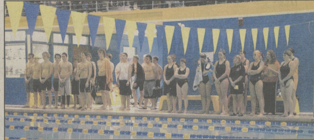
The Tunkhannock swim team recites the 'Pledge of Allegiance' prior to the beginning of the meet.