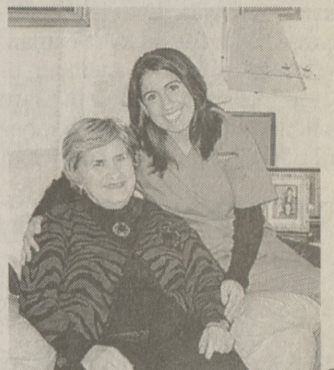
Wilkes-Barre • 842-3005