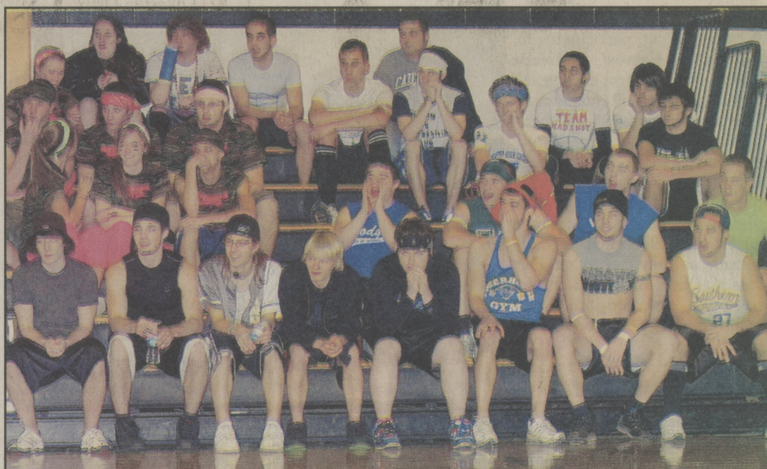
Above: Lake Lehman students turn out in full force to watch the dodgeball games.