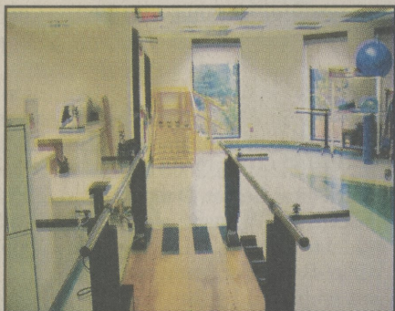
The new physical, rehabilitative and occupational therapy room at the Meadows Center, Dallas was dedicated last week.

The Meadows Nursing Center has a new addition – a 3,000 square foot rehabilitation center. Grand-opening ceremonies for the new center were held recently, complete with refreshments and a ribbon cutting.