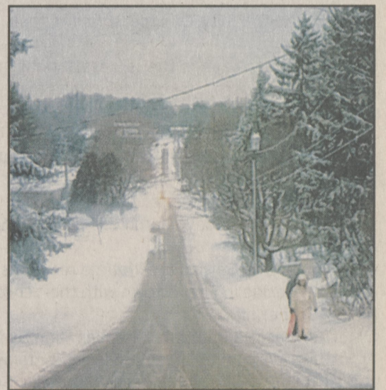
The view down Sterling Avenue in Dallas during a snowstorm is picturesque.