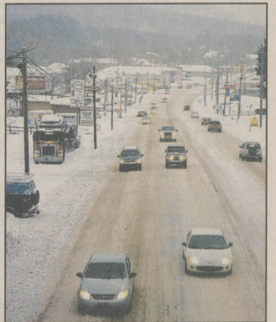
Resident commuters on Route 309 struggle to get home from work last Friday evening.