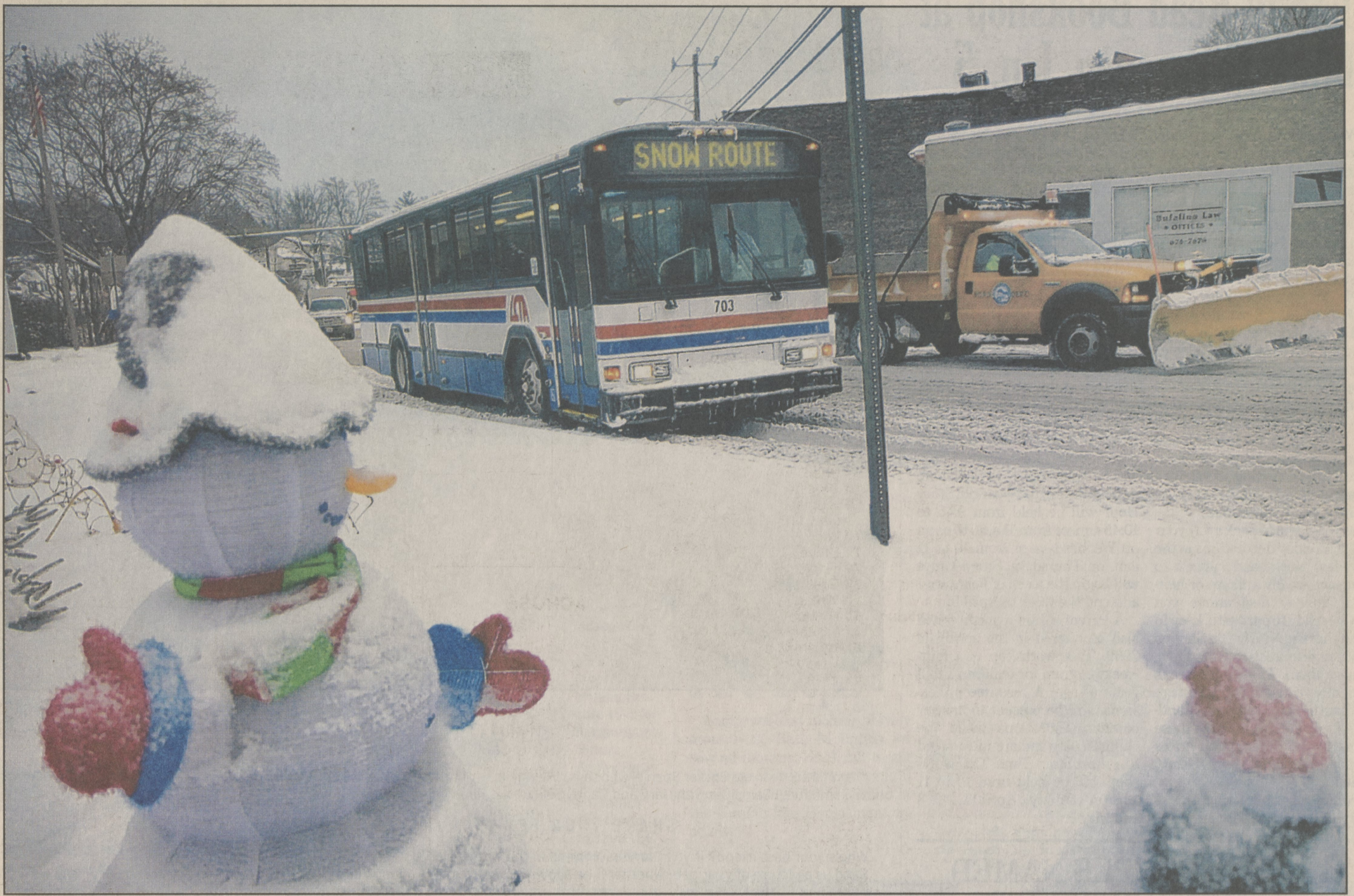
The town's snowman had the last laugh as even the LCTA bus had trouble getting through Dallas Center.