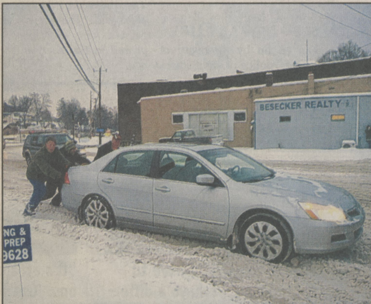
Good Samaritans help a fellow motorist out of the snow banks at the Dallas Center intersection.