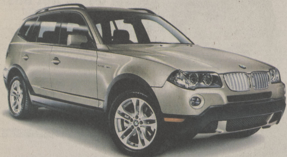
3 X3's available starting at $20,995