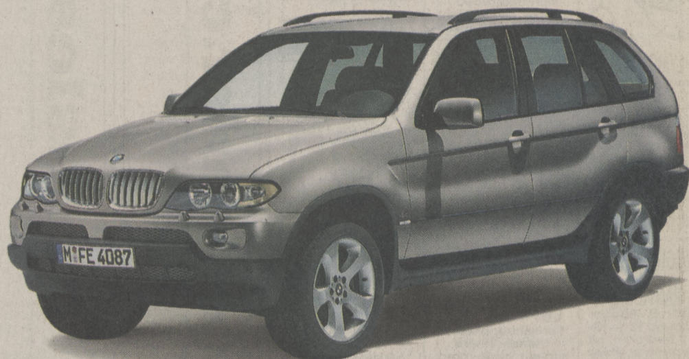
3 X5's available starting at $26,995