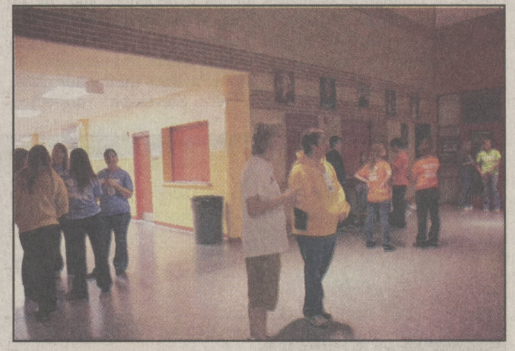
Filling the halls at Lake-Lehman High School were different colored tee-shirts, signifying members of different classes.

For more photos, visit www.mydallaspost.com.