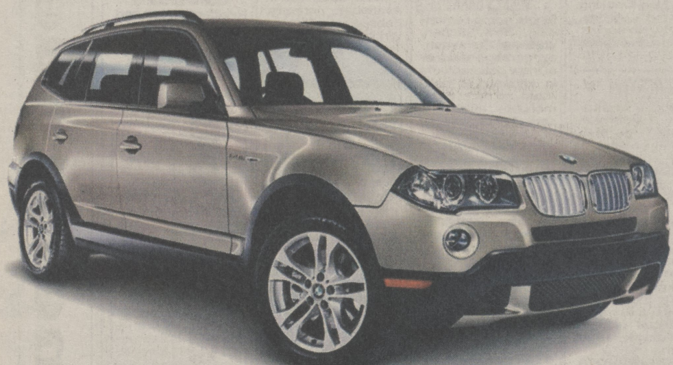
3 X3's available starting at $20,995