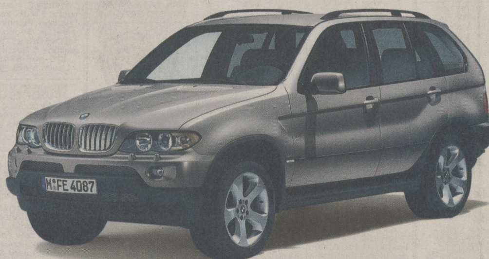
3 X5's available starting at $26,995