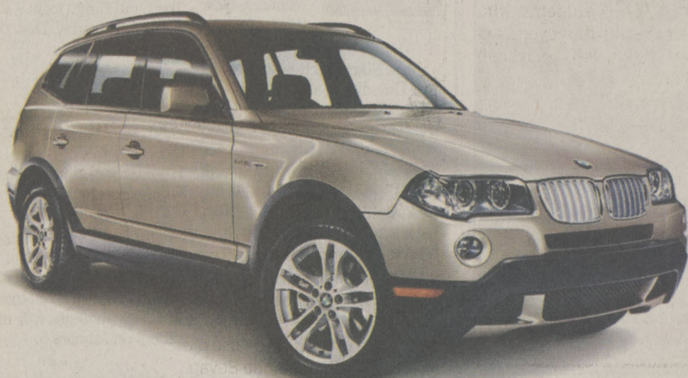
3 X3's available starting at $20,995

www.wvmbmw.com 1-866-623-1094 (570) 287-1133