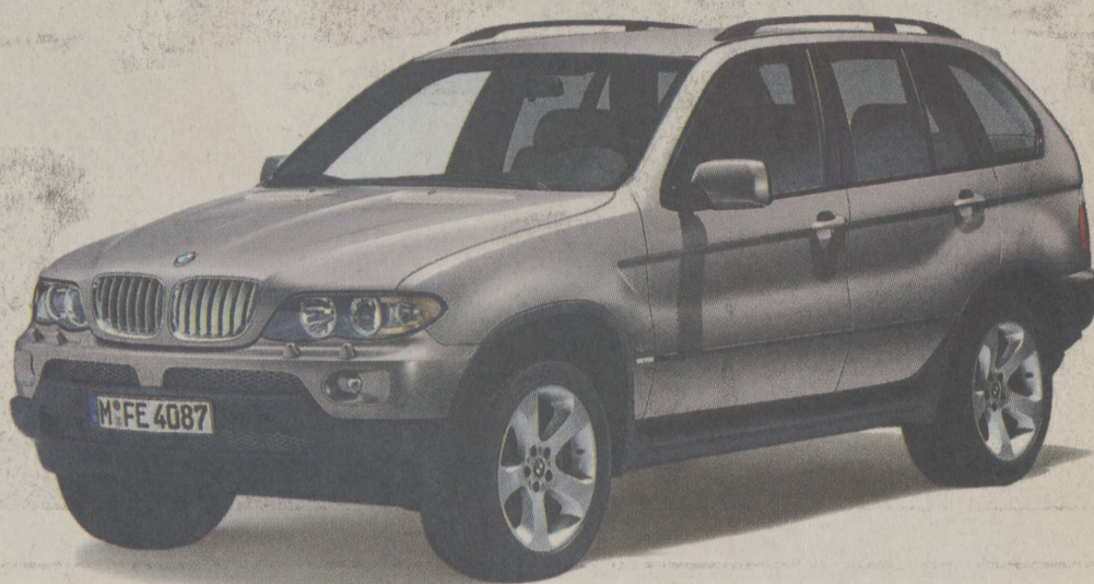
3 X5's available starting at $26,995