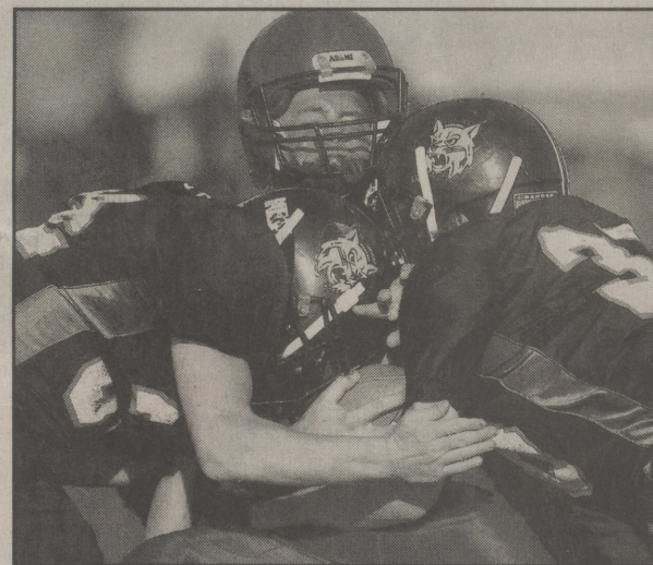
The Back Mountain "A" team defenders give it their all in an attempt to hold off Plymouth.

The Raiders will face undefeated Dallas today at 11 a.m. at Wyoming Valley West Stadium. The Dallas Jr. Mounts defeated KT, 12-8, in week 3 for their only loss of the season.