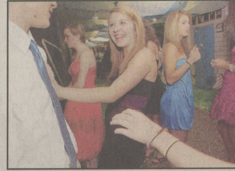
There were plenty of laughs at the Dallas Homecoming Semi-Formal.