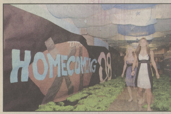
Women quickly discarded their shoes to walk comfortably around the decorations at Dallas Senior High School during the Homecoming dance.