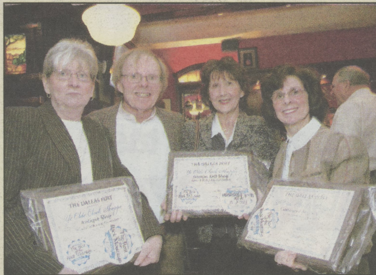
The staff of Ye Olde Clock Shoppe shows off its many awards.

Nearly 150 people viewed a Power Point presentation, paying homage to the winners as their names were read and they were showered with accolades from those in attendance.