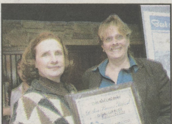
The Dallas Harvest Festival was voted Best Organized Event.