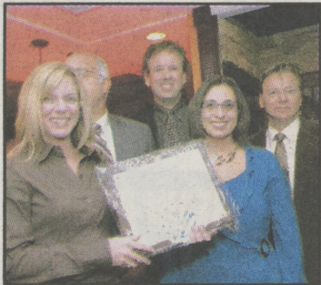
The staff of Eye Care Specialists is proud of its award.