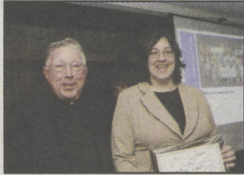
The Meadows Nursing Center was voted Best Nursing/Retirement Home.