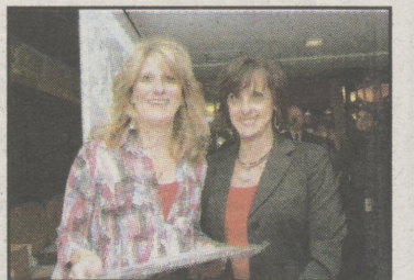
Snips & Tips was voted Best Hair Salon.