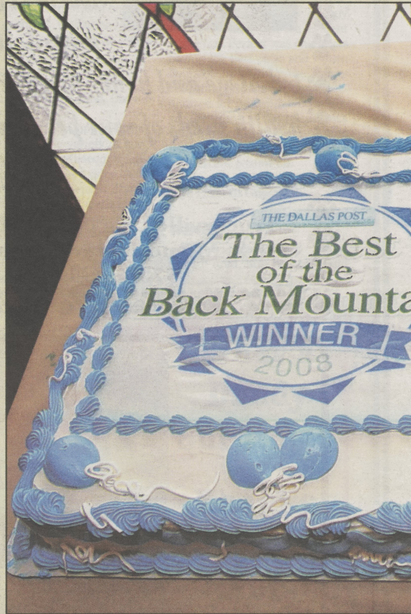
A cake featuring the Best of the Back Mountain 2008 logo provided a delectable centerpiece.