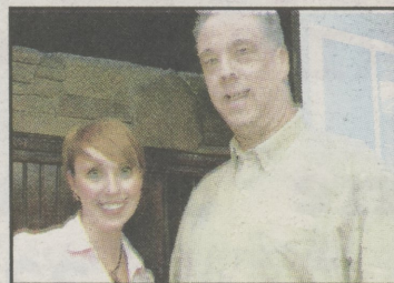
Burger King received the most votes for Best Burger.