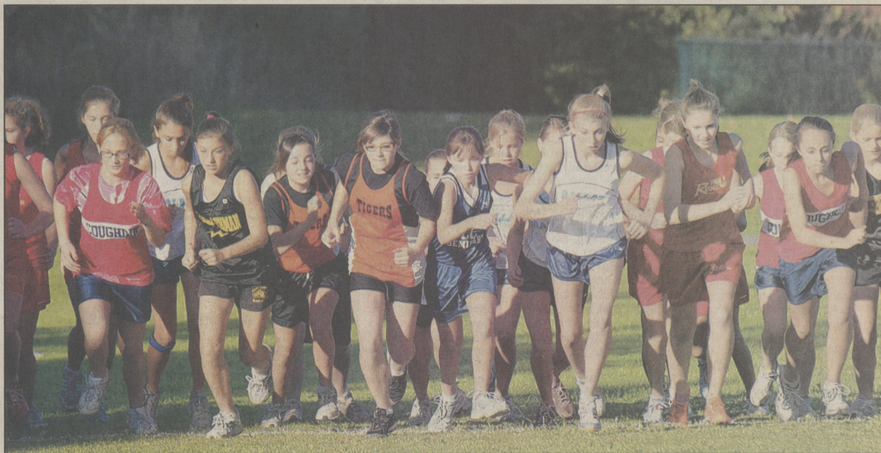
The first line of female contestants takes off.