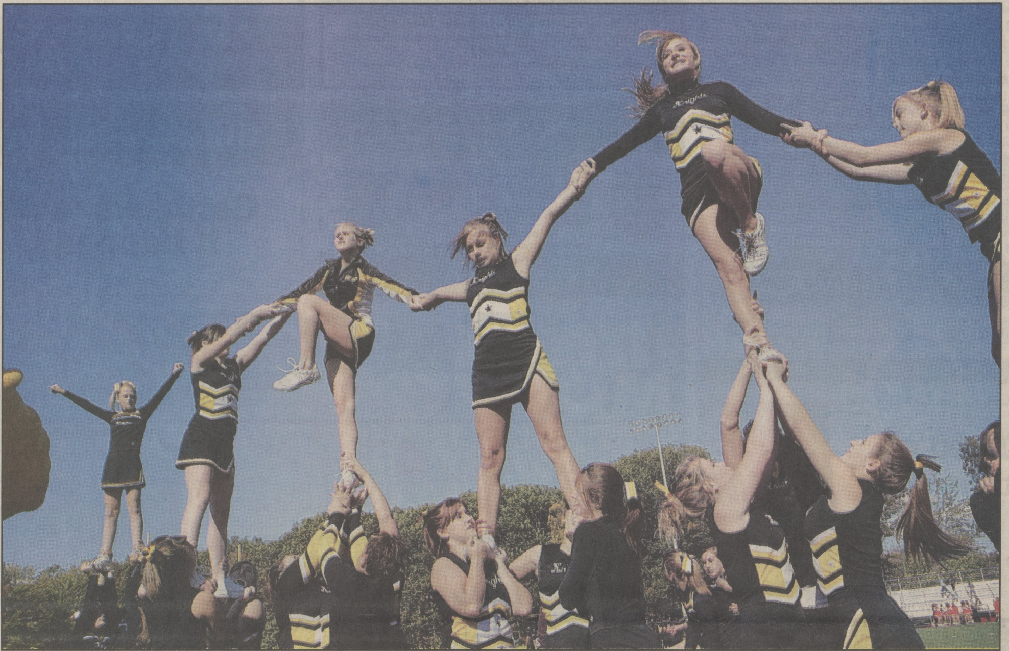
Members of the Lake-Lehman junior varsity and senior cheerleading squads perform during the homecoming game.