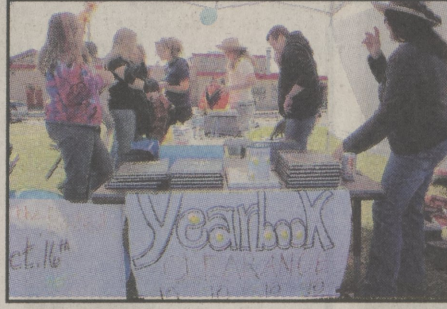
A yearbook booth set up at the homecoming game helps defray the cost of next year's books.