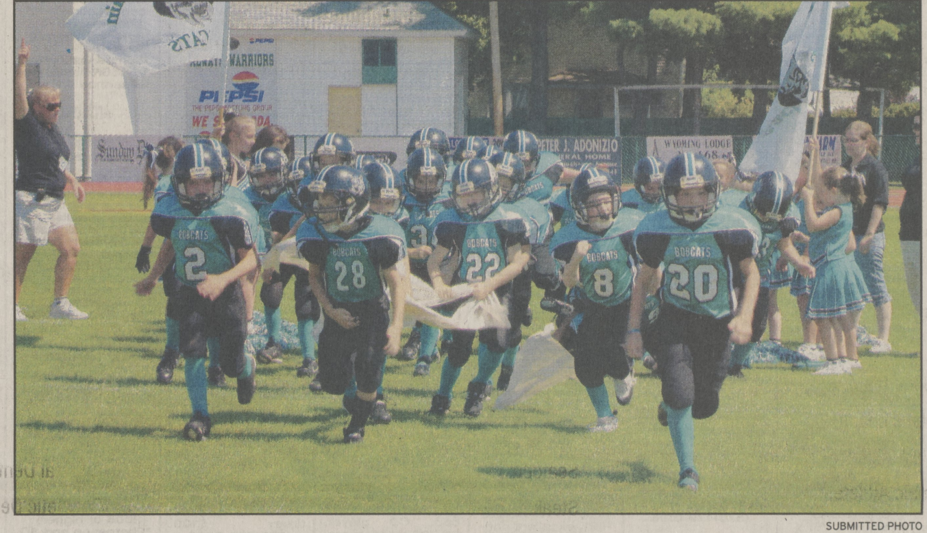
Members of the Back Mountain Bobcats C team enter the field to meet their opponents from West Pittston.

safety for Back Mountain. The Bobcats A team is off until Sun-