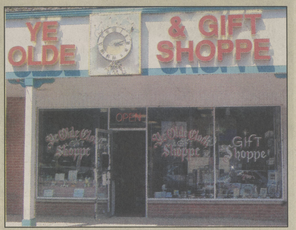
Ye Olde Clock & Gift Shoppe, located in the Dallas Shopping Center, is celebrating its 40th anniversary this summer.

In an effort to meet the demands of today's consumer, the business recently launched its own Web site, yeoldeclock-