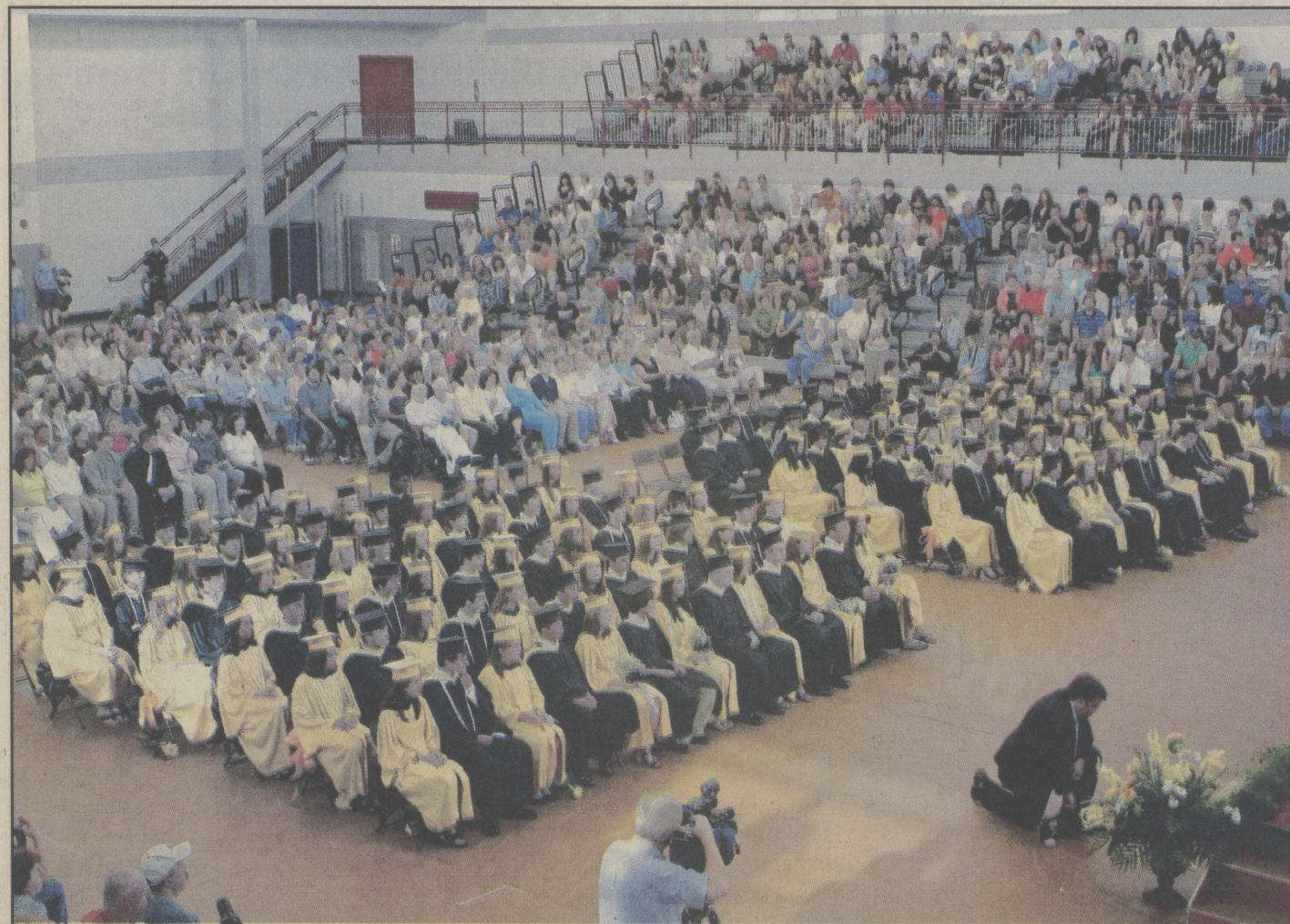
The graduating class at Lake-Lehman High School celebrates its graduation in the school gym due to possible inclement weather.