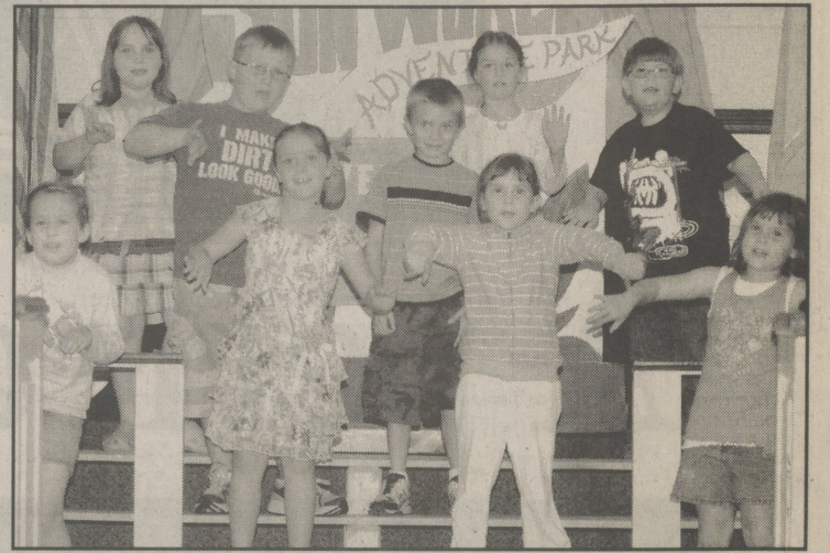
Children of CMUMC sing a song for the congregation during the closing program of the church's Vacation Bible School.