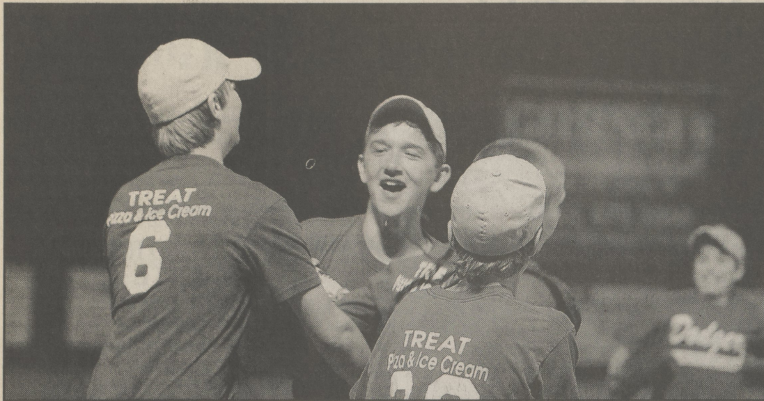
Members of the Dodgers team celebrate their 2-1 win over the Giants in the National League playoff game at the Back Mountain Little League.

The Rangers trounced the Yankees, 12-3, in the American League playoff game while the Dodgers squeaked by the Giants, 2-1, in the National League playoff game in the Back Mountain Little League. The Rangers and the Dodgers then met each other in the league championship game.