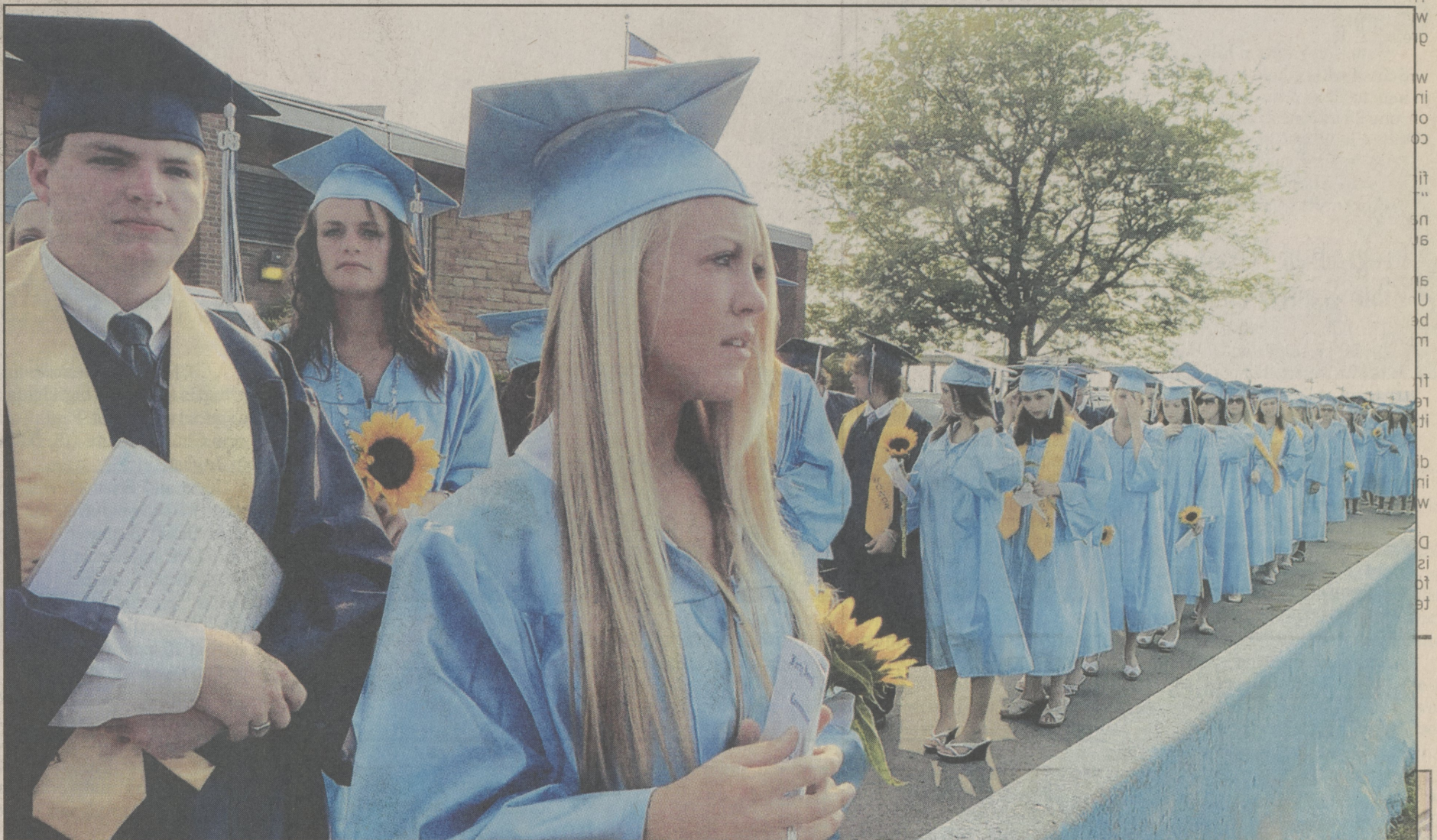
Dallas grads walk to the commencement exercises.