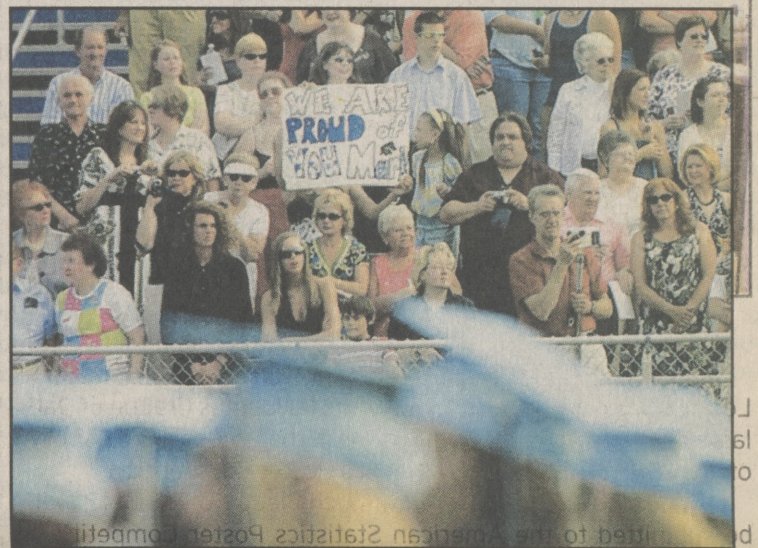
A proud fan holds up a sign, congratulating a graduate.