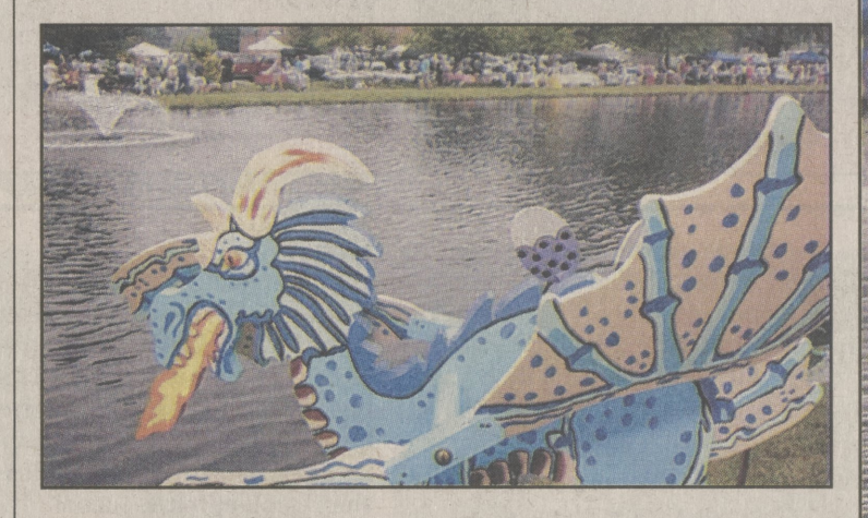
Creatures like this one appeared as denizens during the annual Meadows Nursing Center's Market on the Pond.