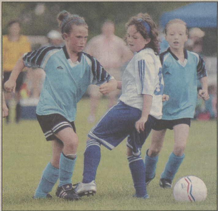
Two on one is never a good scenario but this Back Mountain player (in white jersey) stays in the game.