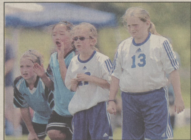
On the sidelines, girls from both teams stand together but, when they're on the field, the competition is fierce.