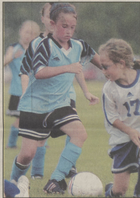
A Back Mountain player (No. 17) gives it her all as she attempts to steal the ball from her Abington Heights counterpart.

Here, members of the Back Mountain U9 team square off against a team from Abington Heights.