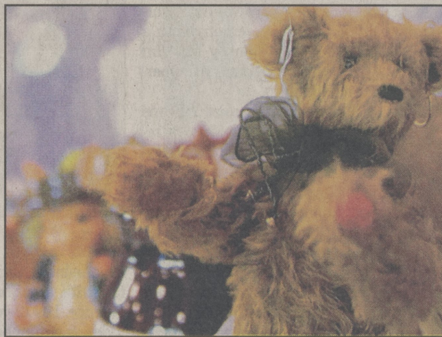
A Golden Mohair Daneer is displayed at the mini auction.