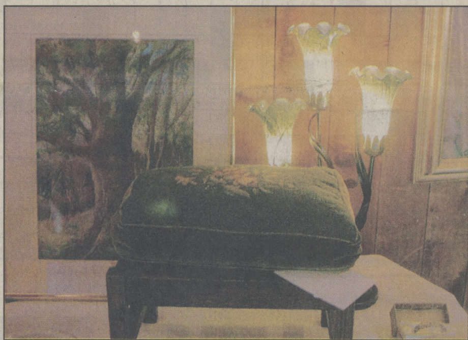
A needlepoint footstool and pillow are on display at the mini auction.

See www.mydallaspost.com for more photos.